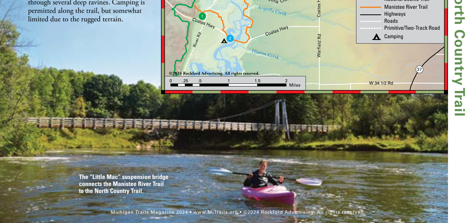
The "Little Mac" suspension bridge connects the Manistee River Trail to the North Country Trail.

Manistee River Hiking & Water Trail • North Country Trail